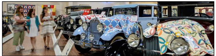
Quilts and cars...what could be better?

The Blue Gate Garden Inn is not associated with any of the chain hotel/motels and that’s refreshing. Large well decorated rooms and friendly helpful staff, the Inn even has an ice cream parlor in the lobby.