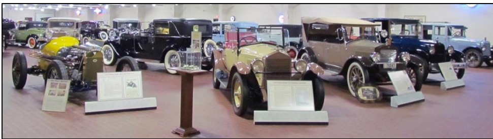
Hostetler Hudson Museum - adjacent to host hotel